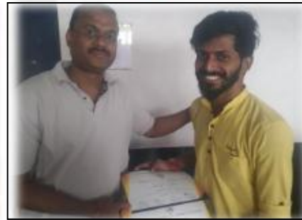
4 th Place