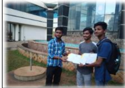
2 nd Place