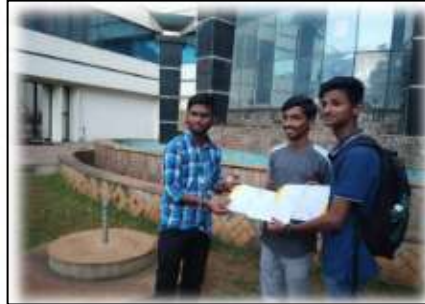
2 nd Place