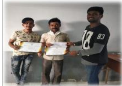
1 st place