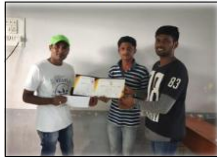
3 rd Place