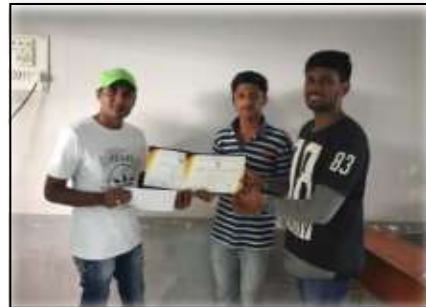
3 rd Place