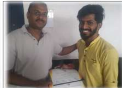
4 th Place