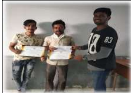
1 st place