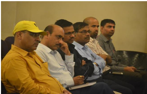
Principal Sir & Faculty Members