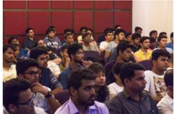
S.E. orientation program conducted on 3 rd August 2016.