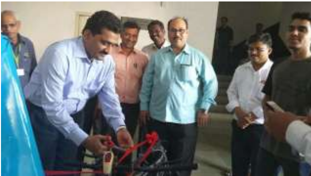
National Science Day, inauguration by Hon. Principal of its one-of-a-kind HPV (Human Powered Vehicle).