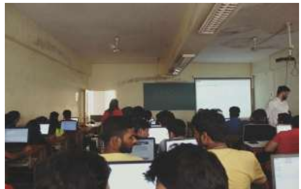
Workshop MECH_IT on designing softwares Sept-2016