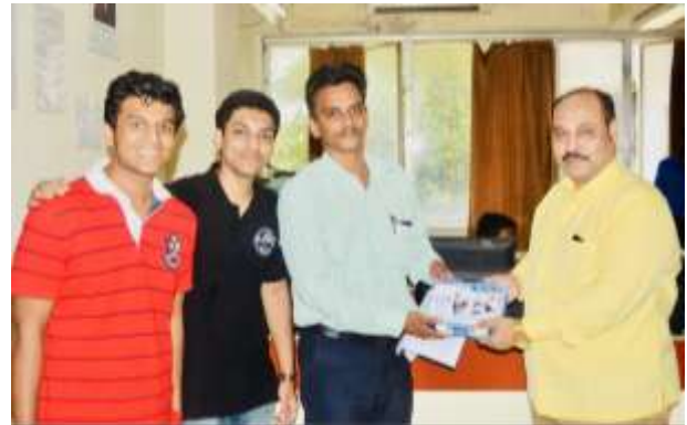
Awareness on First Aid – ASME presenting First Aid Box to the Department