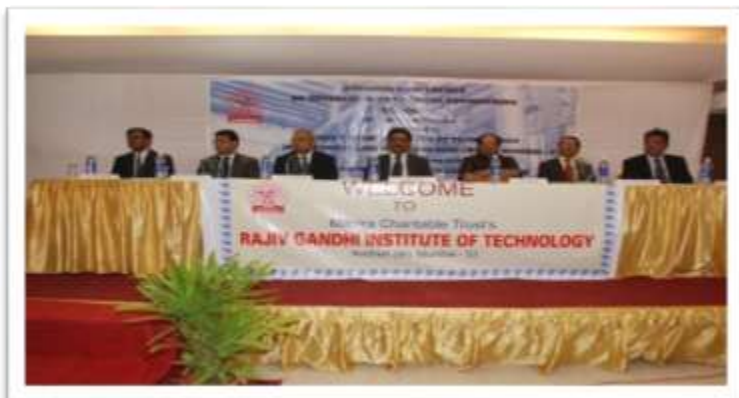
National Conference on Advances in Mechanical Engineering, In Association with Bhabha Atomic Research Centre, January 15-16, 2009