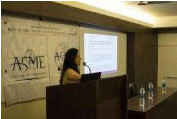
WORKSHOP ON CANCER AWARENESS by ASME on 6 th February 2018