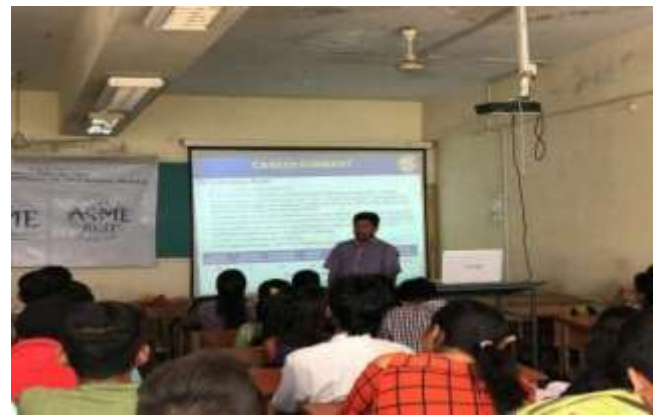
SEMINAR ON FINITE ELEMENT ANALYSIS by ASME on 14 th February 2018