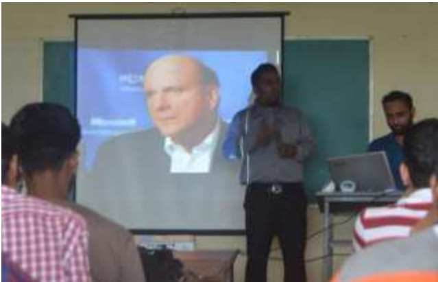
A seminar on CAD Oct 2017