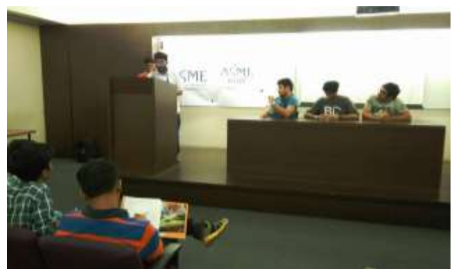
Science Quiz for FE and SE students on National Science day 28 Feb 2017