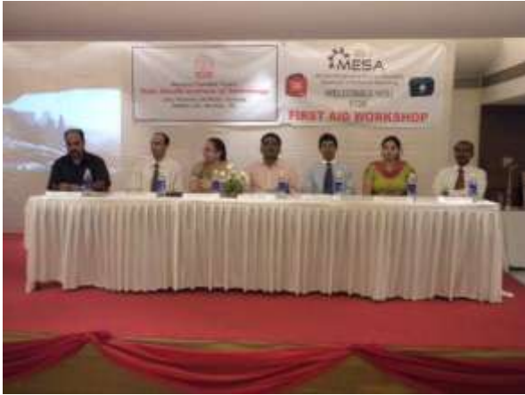
Workshop on First Aid training in August 2010. Expert Doctor from Kokilaben Dhirubai Ambani Hospital, Andheri(W), Mumbai