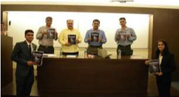
A medley of emotions Inauguration of Department Magazine, News letter and the Valedictory function. 25 th April 2017