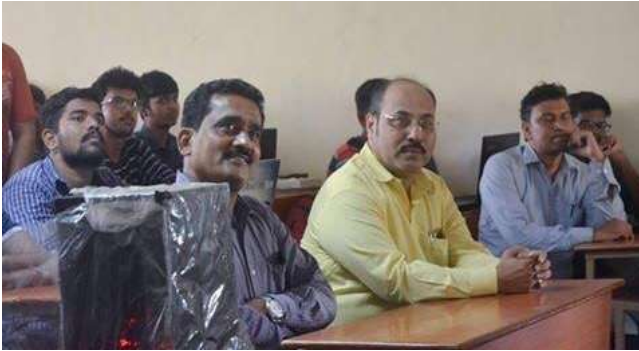
Inaugural Day of One week workshop on advanced Solid Works, a 3D modeling software, under its MECH IT series 25 th -29 th Sept 2017