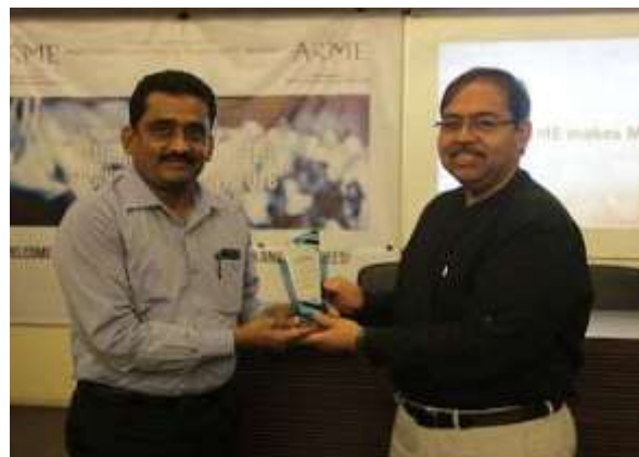
ASME INDIA EARLY CAREER ENGINEERS by ASME on 7 th & 8 th April 2018