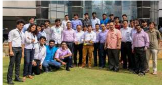
The two-day Quadcopter workshop launched their drone into the air filled with cheers and applause 11 th Aug 2017