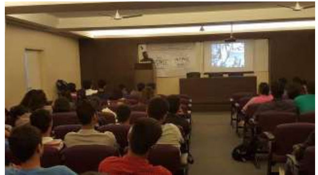
Seminar on ENGINE OVERHAULING for SE students 16 March 2017