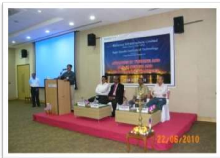
Advances in Thermal Engineering” by Mech. Dept. in collaboration with Reliance Thermal Power Station, Dahanu on 21 st to 26 th June 2010